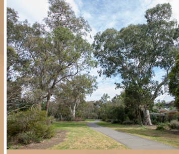
RIVER RED GUMS (Eucalyptus camaldulensis)