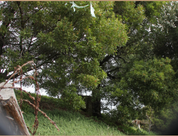
The Moorabhin Reservoir has a substantially greater diversity of wild, indigenous flora, that is in a more resilient state than anywhere else in Glen Eira. The site is not open to the public, but flora can be seen from the footpath on Warrigal Road.