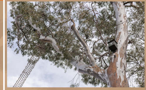
RIVER RED GUMS (Eucalyptus camaldulensis)